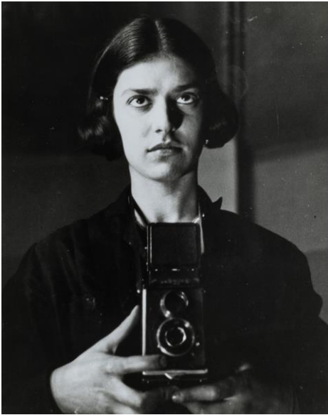
Zelfportret met Rolleiflex camera, Berlijn, 1931