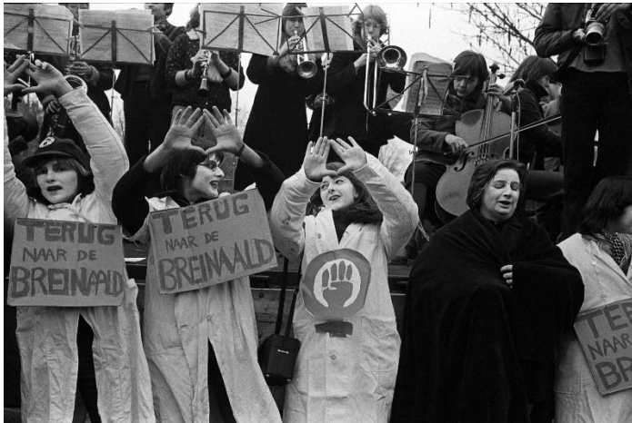
Protest van feministische actiegroep Dolle Mina: 'Terug naar de breinaald', Amsterdam, 1976