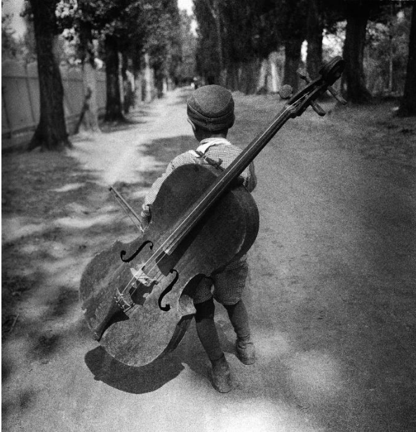
Jongen met bas, Balatonlelle, Hongarije, 1931