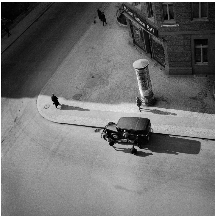
Starnberger Straße, Berlijn, 1931